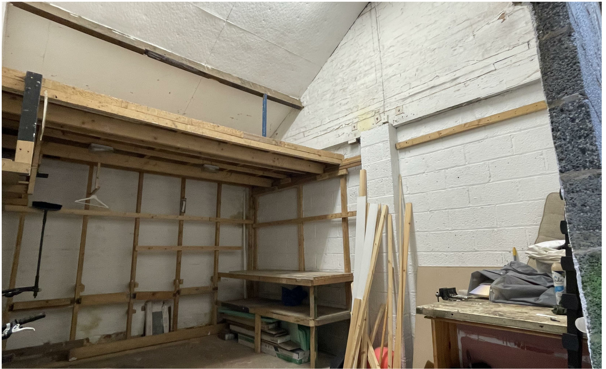
Unit 2 Gladstone Lane, Scarborough YO12 7BP Price Guide £50,000